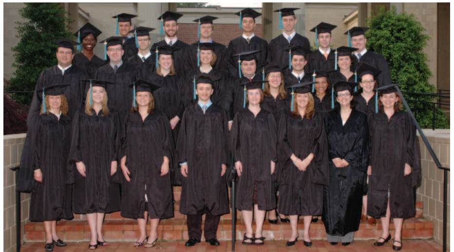
On May 13, 2007, the School of Government’s Master of Public Administration Program proudly graduated twenty-nine students from its two-year curriculum. The students will pursue careers ranging from work in local governments and nonprofits to service in federal agencies in Washington, D.C. Congratulations, graduates!

making a difference in North Carolina and across the country. We congratulate these students on their accomplishment and celebrate with the MPA Program its four decades of educating public service leaders.